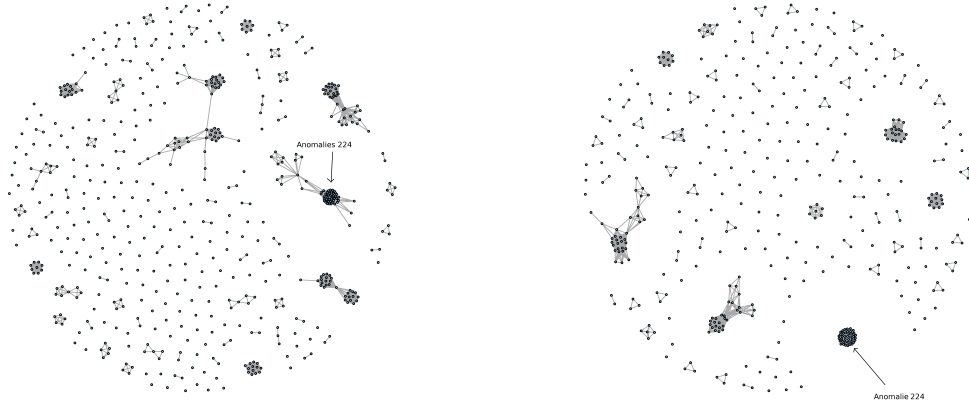
Fig. 3. Two levels of cliques appearing when correlating anomalies in different sub-spaces