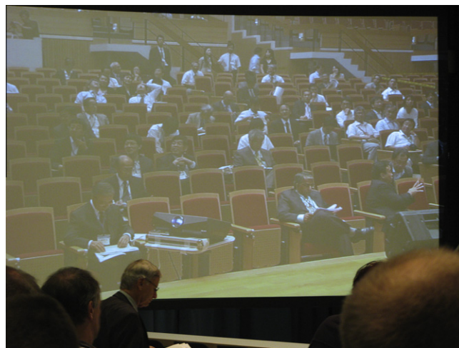
Fig. 1. Transcontinental plenary session, from the perspective of the Davos audience. The remote audience is projected on a large screen, creating together with the local audience a ‘virtual auditorium’.

Hischier and Hilty (2002) introduced a list of sources of the environmental impact of an academic conference: