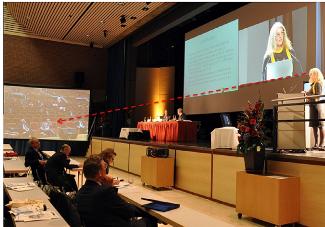
Fig. 3. The two audiences are placed in a 90° angle, and the speaker faces each audience at 45°.