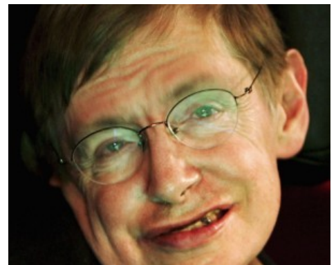
Stephen Hawking Says Earth is Likely Doomed