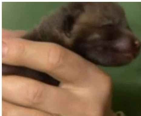
Family Realizes Tiny Puppy Isn't a Puppy At All