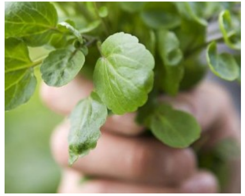
Ten Vegetables You Can Grow Without Full Sun