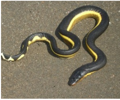
Highly Venomous Sea Snake Spotted For First Time In 30 Years