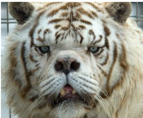
This Is Why No One Should Ever Breed White Tigers