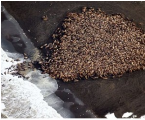
Climate Change Nightmares Are Already Here