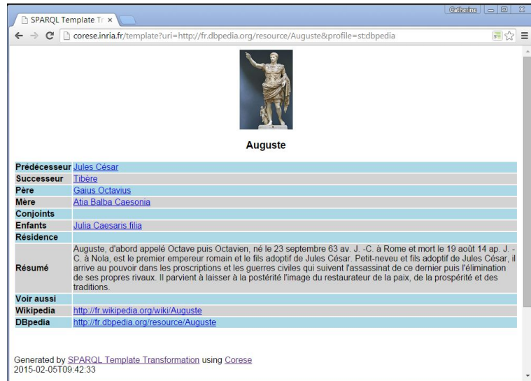
Fig. 2. DBpedia Navigator

The DBpedia SPARQL endpoint is accessed through a SERVICE clause in a predefined CONSTRUCT query to retrieve relevant data according to the types of resources that the application is interested in: our navigator focuses on historical people and places. Then the st:navlab transformation is applied to the resulting RDF graph. It generates a presentation in HTML format of the retrieved data, adapted to the type of targeted resources — people and places. In particular, the transformation localizes places on a map.