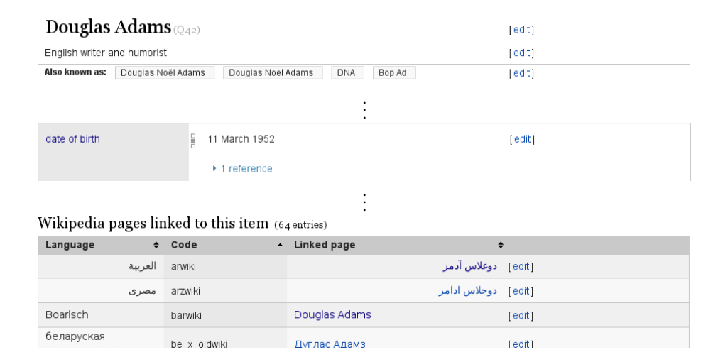
Fig. 1. Excerpt of a typical Wikidata item page with terms, statements, and site links

In the familiar terms of semantic technologies, items represent individuals and classes, and Wikidata properties resemble RDF properties. Virtually every Wikipedia article in any language has an associated item that represents the subject of this article.