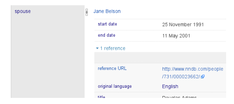
Fig. 2. Part of a complex statement about the wife of Douglas Adams as displayed in Wikidata