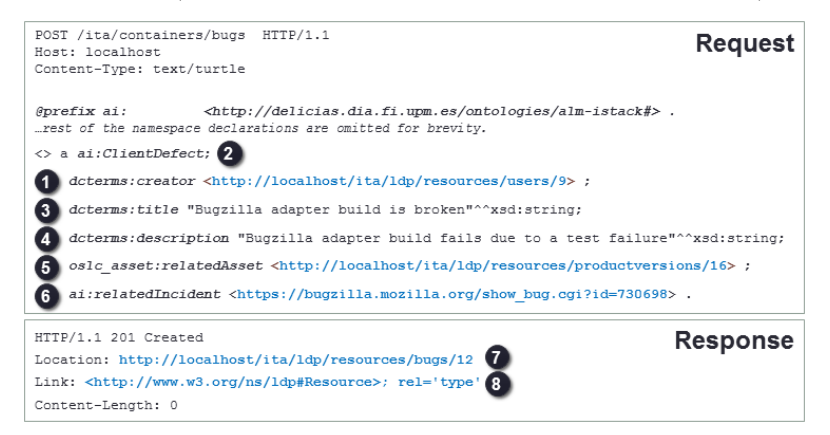
Fig. 2. Creation of a new bug using the Bugzilla LDP adapter

This demonstration shows how LDP clients can use the adapter to access the Bugzilla bug tracker and to perform tasks such as discovering bugs reported against a product, modifying the status or the other properties of the bug, or creating new bugs (e.g., Fig. 2 shows a creation request and response).